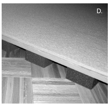
D. Place a carpet (or other flooring) on the decking and your drum kit is now well isolated from your floor.