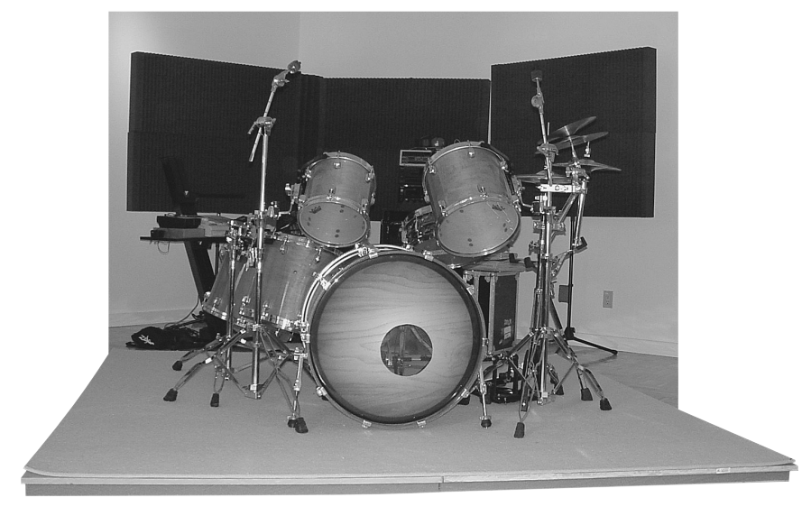
PlatFoam™ Isolation System at work surrounded by a MAX-Wall!

Check out www.auralex.com for all kinds of product and technical information.